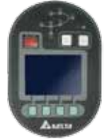
Control and LCD Display Panel

All specifications are subject to change without prior notice.